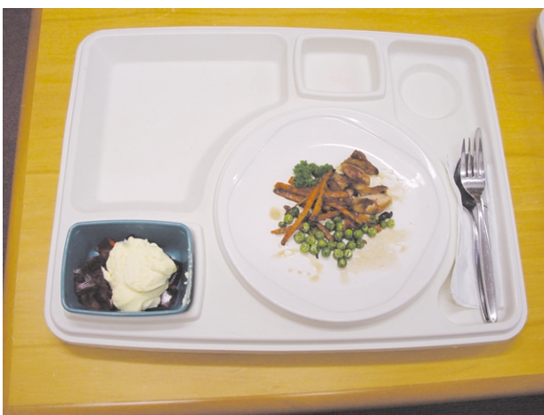
Figure 2. 4:1 ratio lunch for a child age 6 years.

Children are admitted to the hospital for 5 days in which the ketogenic diet is slowly advanced after a 24–48 h fast (panel 2). 9 There is some evidence to indicate that a fast is unnecessary for long-term efficacy. 12 However, we still find it valuable to monitor patients on admission, watch for acute worsening on the diet, educate families, and complete any aetiological assessment. The immediate benefit occasionally seen with fasting can be very reassuring and families have a potential clinical tool to quickly increase ketosis in the future if necessary. 13 Parents tend to be universally more concerned about the fast than the children and are surprised by how easy it is. However, hypoglycaemia (serum glucose <30 mg/dL) during the fast can occur and be symptomatic. We tend to give 30 ml of orange juice in those situations with a follow-up glucose check in 1 h. Drug regimens are not changed for 3–6 months, although we have found an earlier tapering can be safe. 14 Routine use of magnesium, zinc, vitamins D and C, B-complex vitamins, and calcium is recommended.